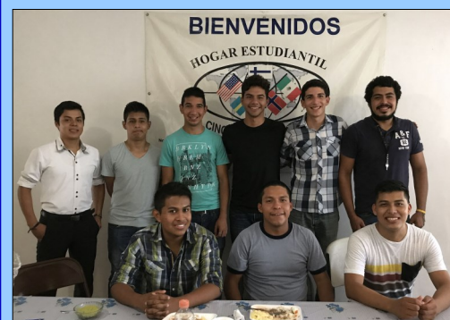
9 of the 15 young men living at Casa Cinco Banderas in Monterrey

Would you rather receive an e-newsletter instead of this paper copy?