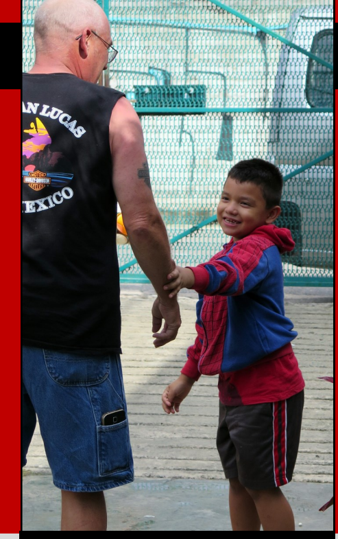
"Come play with me! "