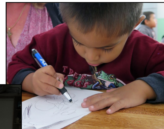
Above, a child at the Shelter just starting his education. To the left, one of our Cinco Banderas students that just graduated from the university in Monterrey and is ready to take his place in society and work to make a difference!