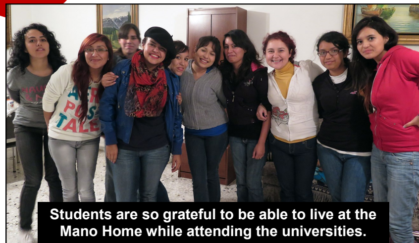
Students are so grateful to be able to live at the Mano Home while attending the universities.

We believe that only when these three goals are met, and specifically goal #3, that Mexico will become a place for children and families to thrive and feel safe. That is why we have two Homes in Monterrey for young people striving to complete an education at the universities, learn a career, and start giving back to others. The Mano Home for young women houses 10 girls who are working on their goals to become engineers, nurses, teachers, and an attorney. Our Cinco Banderas Home provides a place for up to 12 young men to stay while they work on degrees in mathematics, engineering, etc. Paying just a minimal amount each month toward food costs, these young men and women are able to attend a school they would normally not be able to attend.