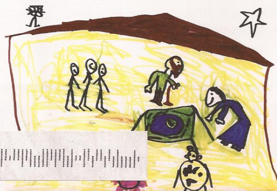
A child's depiction of the Nativity