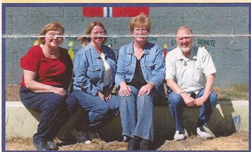
Some of the USA Board

Your gifts to the children and youth in Mexico may be your way of embracing with love those who are born in poverty, who are neglected and do not have much hope for the future. "What you have done for them, you have done for me!" said Christ.