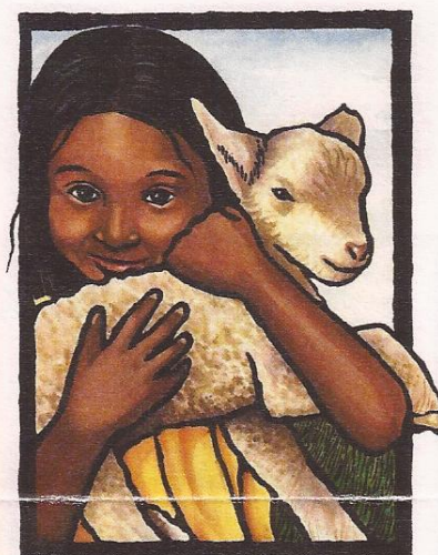
Thanks to Bruderhof USA for this drawing

Caring Action for Children now helps about 45 children at the Mama Paulita Home, 22 at the La Familia Home, 24 at the Esperanza Home, 50 at the Shelter Home, 22 at the Cinco Banderas Student Home, 12 at the MANO student home and 10 at the new Indigenous Home. In addition, we help poor students with funds for schooling and for children in two Outreach Programs in slum communities. Thanks so much for making the Caring Action programs possible!