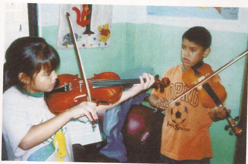
Children in the Shelter are taught violin and keyboard