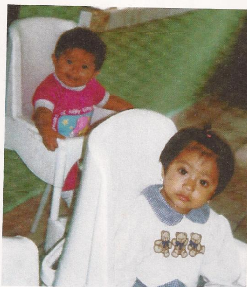
Two infants in high chairs wait to be fed in the Shelter