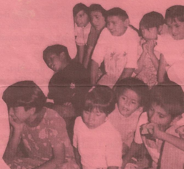
TV TIME AT LA FAMILIA