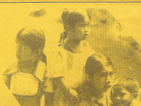
A young mother and her children are waiting outside a clinic with her sick boy. Sometimes it takes all day to see a doctor.