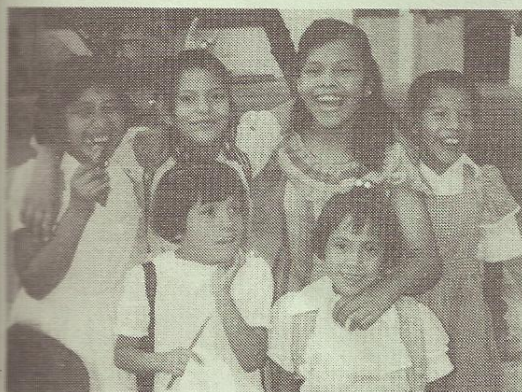
Do you like Christmas? "Si!"