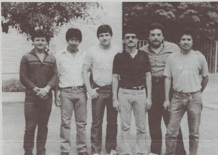
SIX OF THE EIGHT SEMINARY STUDENTS WHICH YOU SUPPORT.