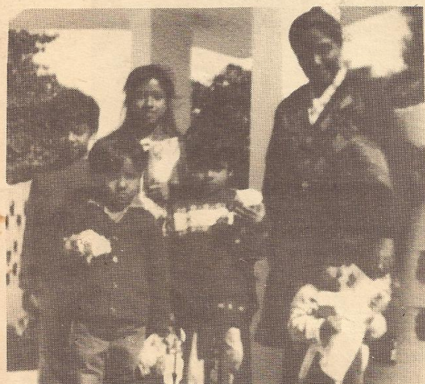
FAMILY IN VALLES BEING HELPED EXCERPTS OF LETTER FROM VALLES

Thank you again for your generous help for children in Mexico. Your check for $400 arrived toward the end of last month.