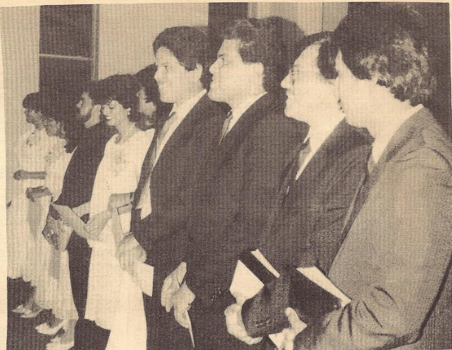
GRADUATING SEMINARY STUDENTS

Here are great possibilities of helping young people with an education. Many of the youngsters have already finished the instruction and have now good positions in society. Many are standing in line hoping to be admitted into the program. THIS IS HELP TO SELFHELP.